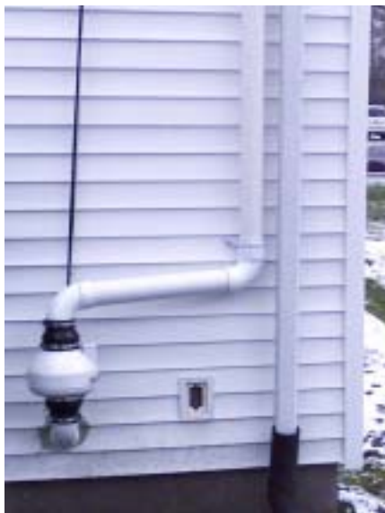
A subsurface depressurization system fan on the exterior of a building.

An effective method to prevent vapor intrusion during the cleanup process is to install subsurface depressurization systems at the affected buildings. The two most common types are the sub-slab depressurization system and the sub-membrane depressurization system .